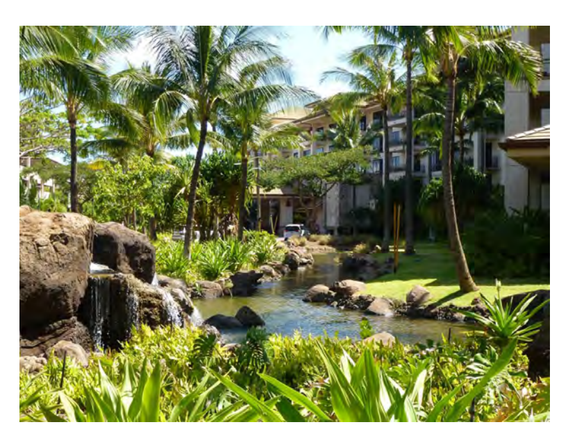
2021 ASLA Hi Awards, General Design Merit Award, The Westin Nanea Ocean Villas, Ka'anapali, Maui. Walters Kimura, Motoda, Inc.