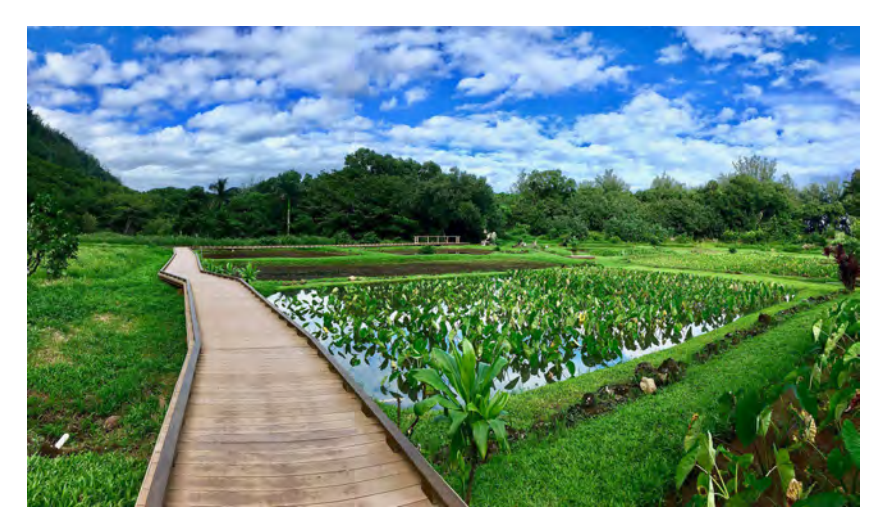
2021 ASLA Hi Awards, Analysis and Planning Honor Award, Ha`ena State Park Master Plan, PBR Hawai`i and Associates, Inc.