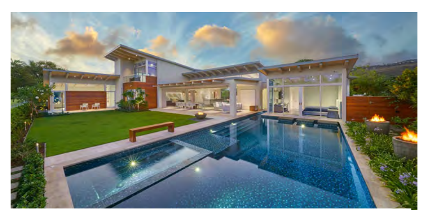
2021 ASLA Hi Awards, Residential Design (Single-Family) Merit Award – Wai'alae Golf Course Residence, HHF Planners