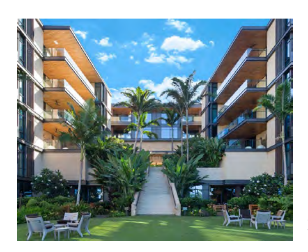
2018 ASLA Hi Awards Residential Design Merit Award, Park Lane, Ala Moana Walters Kimura Motoda, Inc.